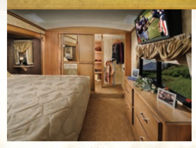
Relax a little longer in our private bedroom retreat. Each Serta® Dreamscape Mattress is a full 60" x 80", or upgrade to the Trump Home® Lux Retreat mattress that gives you the luxury sleep of a five star hotel.

This 38FB2 front bathroom suite provides a choice of a half bath or walk-in pantry near the living area. Add an optional stack washer and dryer and you have the perfect coach for full time travel.