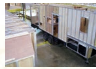
Cedar Creek's famous residential All-aluminum Super-structure (Roof, sidewalls, and floor) on 16" centers or less.