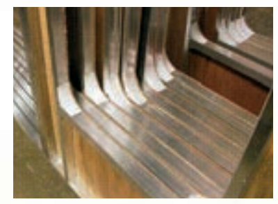
Aluminum window frames.