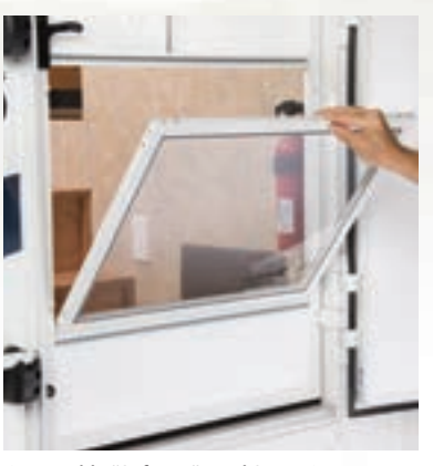
Removable "Soft Top" Vinyl Storm Doors allow light and visibility without losing cooling or heating.

Automotive frameless windows give this coach's exterior an elegance only seen in high dollar fifth wheels.