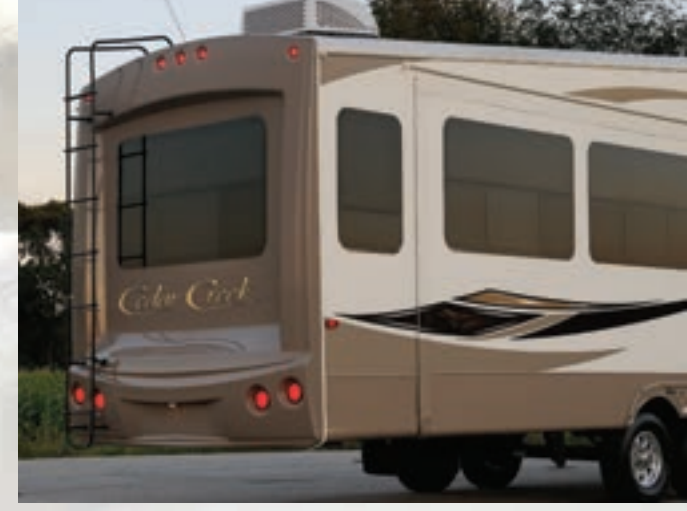
True Nobel Classic fiberglass gelcoat exteriors and end walls. Truly the best of the best in fiberglass. Accept no imitations.