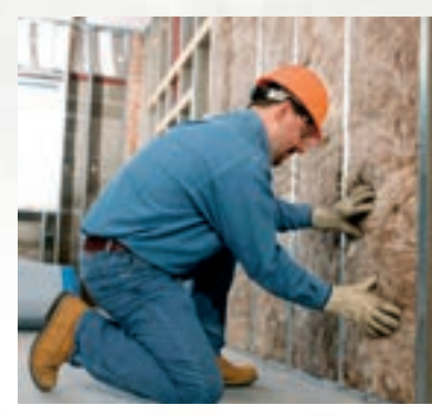
Residential Glasswool Insulation, designed by nature.

Cedar Creek's famous all aluminum super-structure Bonded True Nobel Classic<sup>™</sup> Pearl gelcoat exteriors Hehr automotive frameless windows Optional Level-Up 6-point hydraulic leveling system The Dexter difference - safety and performance package Wired for wireless rear camera Soft top vinyl storm doors Remote control for slides, hydraulic jacks, awning and security lights Black metal wrapped A&E awnings with LED night light strip Radiant Shield thermo-foil R-38 value R-38 • Heating pads on all tanks