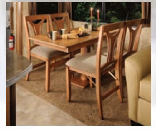
Our freestanding table comes standard with a large leaf extension and four chairs, (two with hidden storage and two fold-away).

A water saving, stainless steel drawer dishwasher is optional on every island kitchen (34RL, 36CKTS, 38CK).